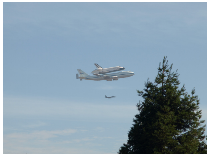
Space Shuttle at Moffet Field

The shuttle program was started to provide a reusable ship that could fly into space and land back on earth like a plane. There were five orbiters in total and they were named Enterprise, Columbia, Challenger, Atlantis and Endeavor. Enterprise was a test vehicle that never saw space, but was instrumental for glide and structural testing. Challenger and Columbia were both lost to accidents that were tragic, but the lessons learned led to many safety upgrades. The program was discontinued after 30 years and 125 missions. The four retired ships are on display at museums around the country.