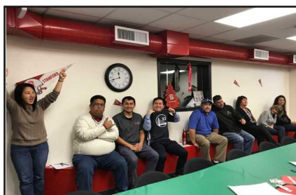
Photo to the Right: Excited and hungry employees ready to taste-test!