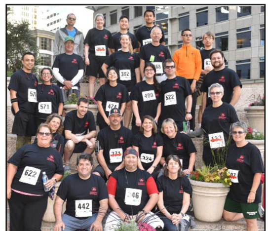
Photo Above: The Western Allied team that participated in the 2018 Stair Climb!