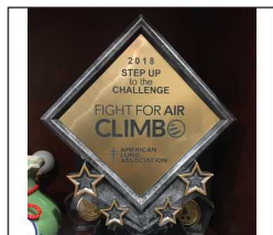
Photo Above: The trophy from the American Lung Association WAM received