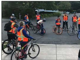
Photo Below: Our WAM Bike team after successfully making it to our office in Menlo Park!

Photo Right: Our biking crew gathers to start their journey!